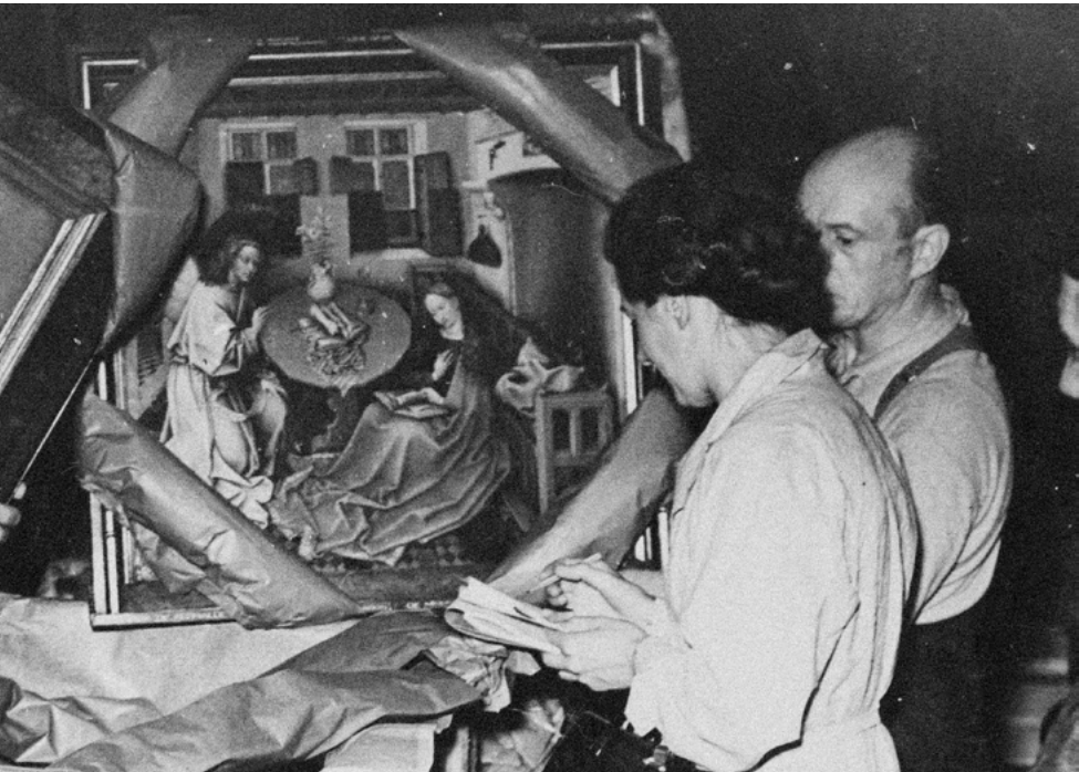
Graphopresse, storage of paintings by Lucas Cranach and Robert Campin during World War II, Augustus 1939 at the Royal Museums of Fine Arts of Belgium, silver gelatin print, 12.9 x 17.9 cm