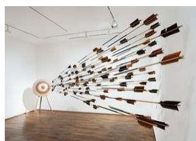
Erogenous Amazon [2019]

Royal Museums of Fine Arts of Belgium – In collaboration with Galerie Templon