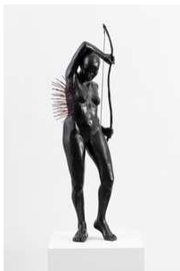
Single Breasted Huntress [2021]

In reference to her 2018 large-scale The Amazon , Prune Nourry has sculpted here the warrior woman's bow and arrow. Nourry's defensive weapon, made from beech wood for its skin tone, has been delicately transformed into a breast seen from the side. This installation can be read as a reference to the Greek myth of the Amazons, but also offers a wide range of poetic resonance, from the healing process to Cupid's arrow.