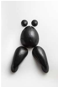
Circle of Life (2021)

the legend, it is said that they mutilated their right breast in order to better handle a bow and spear. Indeed, the word "amazon" means "without breast". Prune Nourry wishes to pay tribute to this mythological figure, which also refers to her own fight against breast cancer.